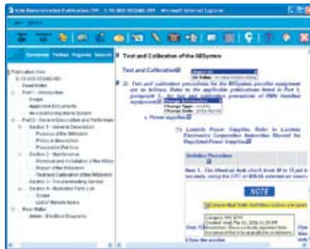
Interactive Electronic Technical Manuals (IETMs)

Stilo was among the very first to explore the possibilities of leveraging web-enabled interfaces for deploying user-friendly Interactive Electronic Technical Manuals (IETMs). This leadership continues as Stilo works with the latest standards, such as DITA and S1000D. The newer standards have focused attention onto a fundamental aspect of an iTIP solution – the information processes underlying an IETM are the most important determinant of success, measured in terms of usability, cost-effectiveness and adaptability.